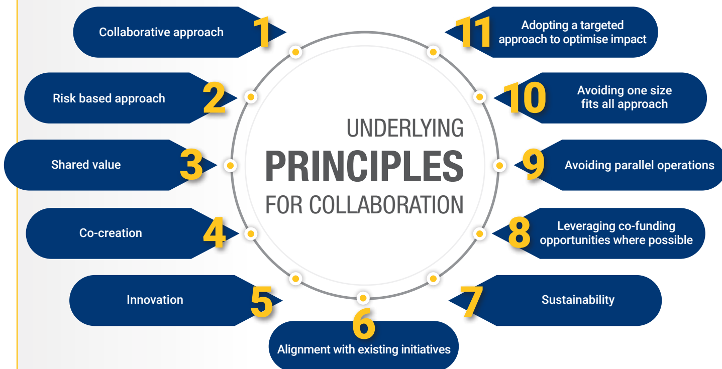
Figure 2: The P4RR underlying principles for collaboration and partnerships